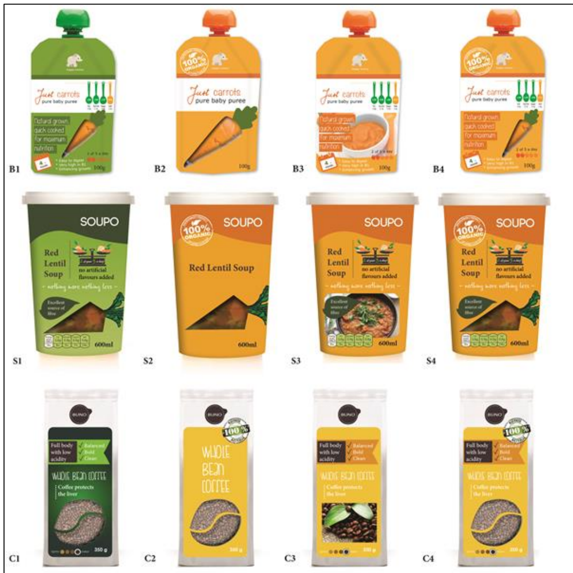
Figure 1: Examples of attribute levels for Baby food (B1-B4), Soup (S1-S4) and Coffee (C1-C4)

The study collected 288 responses from UK consumers via an online consumer panel. This is well above the minimum recommended 100-200 sample size to obtain reliable results from conjoint analysis (Qeester and Smart, 1998). Most of the respondents were women (59%).